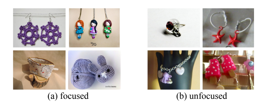
Figure 1. Examples of focused (a) and unfocused (b) images of commercial products correctly discriminated by Variance of Laplacian [21] focus measure operator.

that cannot be directly attached to the product description. We detect the presence of both email addresses and website URLs in product descriptions using a set of regex-based rules, and, for each document, we use the number of external hyperlinks in the associated product description as input feature to our one-class SVM model.